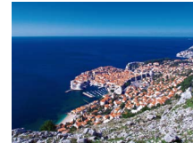
14mm ▶ 28mm [Equivalent]