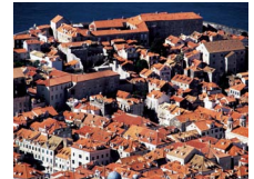
150mm ▶ 300mm [Equivalent]