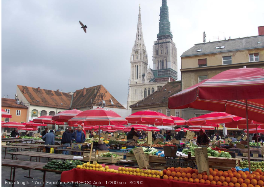
Focal length: 17mm | Exposure: F/5.6(+0.3) Auto | 1/200 sec | ISO200